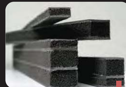
Linear Gap Seal